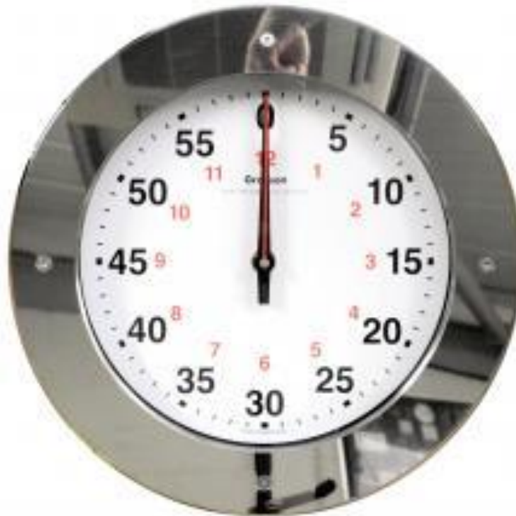
Clock in Theatre