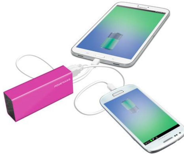
Power bank for mobile phone